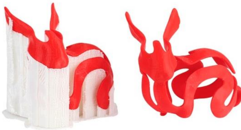
Figure 1. A complete Fused Filament Fabrication print prior to removal of support structures (left) and after (right) (3Dprintr Magazine, 2015)

This process involves heating plastic filament as it passes through the nozzle of a 3D printer. The print head moves according to the .STL file, depositing layer upon layer of melted plastic, building up the model as the print bed is gradually lowered with each layer (Feeney, 2013). Once complete, models are typically ready to use. The only exception is in the case of complex prints, e.g. those with overhanging elements, as these require support structures during printing, which need to be removed manually post-production (See Figure 1).